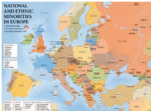
Minorities in europe

The European Centre for Minority Issues (ECMI) is pleased to invite you to the annual conference of its Advisory Council. Since its establishment in 1996 ECMI has worked conspicuously on the implementation of standards that ensured Minority protection and enhanced empowerment of National Minorities. While legal standards improved in many European countries, there is still a lack of integration and social acceptance of National Minorities in many areas. ECMI's Advisory Council is composed of leading international social, political and legal experts on issues related to minorities. This year's annual Advisory Council Conference will address the new challenges that National Minorities face in a changing Europe.